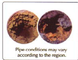
Pipe conditions may vary according to the region.

Tap water Would it be safe if water goes through pipes that might have been rusty or eroded until it reaches our homes?