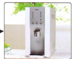
Countertop Water Filtration Device

(The level of contamination inside the tank may vary depending on the number of years of the tank use.)