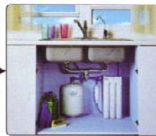
Under Sink Water Filtration Device

The presence of bubbles that rise inside the water tank each time water is poured out clearly shows there is contact with air! Will it be okay to store and drink water that has once been in contact with the air?